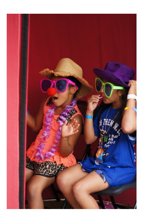
CCDF CHILD CARE DEVELOPMENT FUNDS

Local intertribal events sponsored by the Nine Tribes CCDF Programs